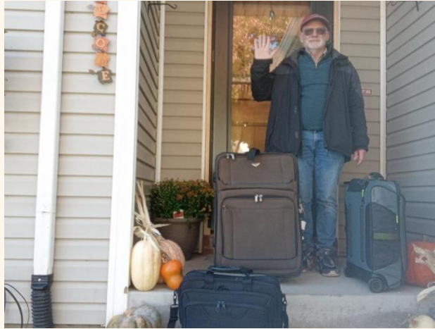
Hello from Colorado